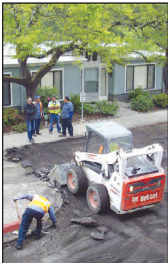
Asphalt repaving underway throughout May. See page 2A.